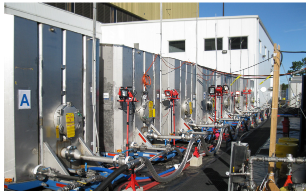
Typical advanced scale conditioning agent setup