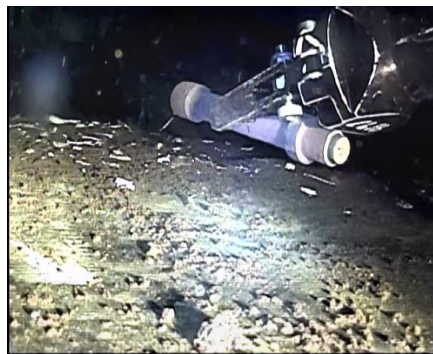
Foreign Object Retrieval