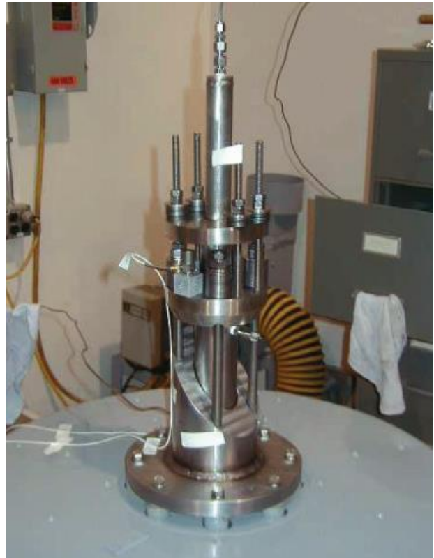
Seismic Testing Assembly of MNSA2