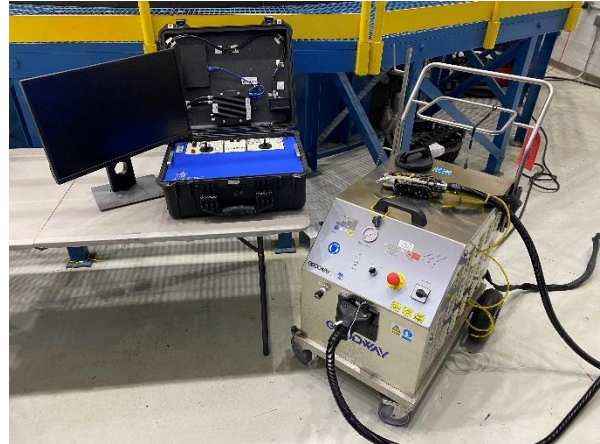
Figure 2 – RVH BMV Inspection System with remote control unit and steam cleaning unit.

The control station for the inspection robot can be located in a low radiological dose area upwards of 100 feet away from the RVH (see Figure 2).