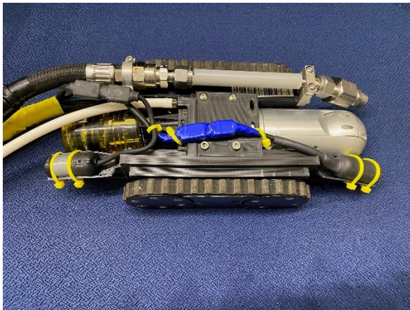
Figure 1 – RVH BMV Inspection System crawler with air puffer and steam cleaning attachment.

The inspection robot is a small, remotely operated vehicle that can be deployed within the gap between the RVH surface and the bottom of the insulation package on most RVH's (see Figure 1).