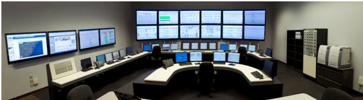
AP1000 control room